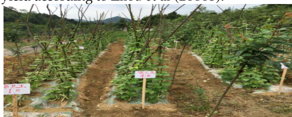
Fig 1. (Color online) The growth of green beans treated with different doses of plasma in field.

From the start-up period, the start-up period of all 8 groups treated by plasma was 2~6 days more than that of untreated CK. To sum up, plasma treatment with different doses (plasma current 200mA~1600mA) can promote the growth, development and yield of green bean, in which the treatment yield effect of appropriate dose (1000mA) was extremely significant, and the plasma current treatment 600mA, 800mA, 1400mA had a significant effect on green bean yield according to Zhou et al (2011b).