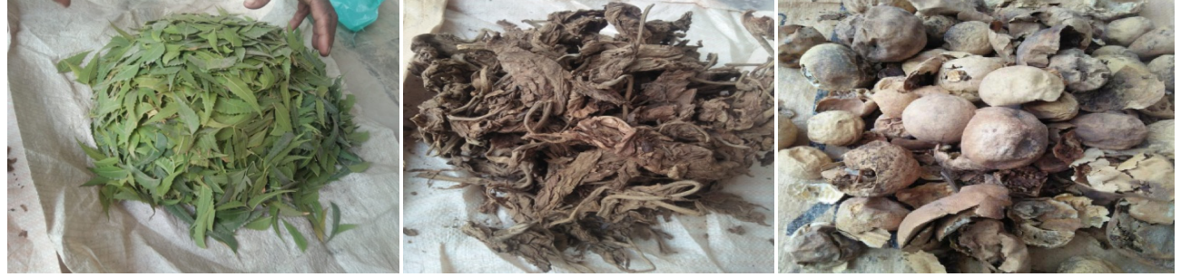
Fig 1. Neem, kortomma and tobacco

After washing, the leaves were grinded thoroughly with a rotary shaker for extraction. Boil these in 20L of water by covering the pot with lid over it as shown in fig.2. The mixture is boiled till 10–12 L of water is remained in it. The extracted mixture is cooled down and filtered using muslin cloth. Spray was done below ETL i.e 5 adults or nymph/leaf. Whitefly population was recorded after pest scouting. The whitefly population was recorded before spray of botanicals and after 24, 36 and 48hrs of spray. Yield data will be recorded at the time of picking. All other agronomic and Plant Protection measures were remained same.